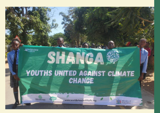
Learners participating in the match past at the Launch of shanga in Lusaka Province.