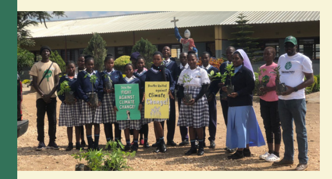
Wvil Executive Director and staff pose for a photo with Leaners and the head teacher at St Maurice Secondary School in Chilanga district.