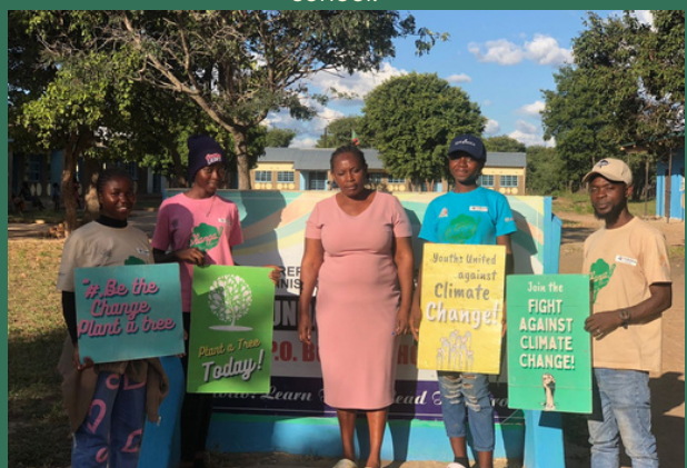
Wvil Volunteer pose for a photo at Bunda Bunda Primary school