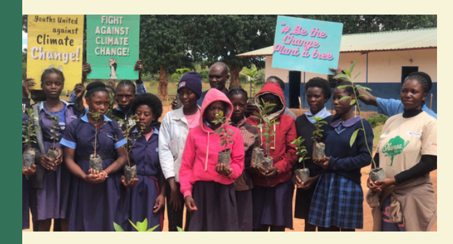
Wvil Volunteer pose for a photo with Leaners in Chongwe district.