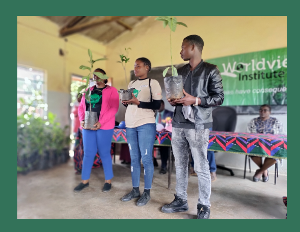
Wvil Volunteer during a sensitization programme in Chilanga District.

Learner at Lukamantano Primary school demonstrates how to take care of trees in Chongwe District.